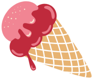
I ce cream